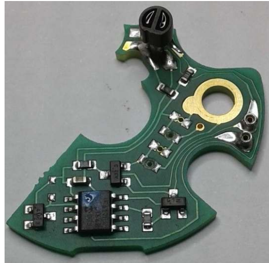
Photo 1 - The circuit board showing the controller (bottom centre).

including removing the hands and dial. Clocks 4 Classics have videos on their website ( www.clocks4classics.com ) which firstly tell you how to determine if your clock is suitable for repair and then provide an overview of exactly what is involved in fitting the kit. There are also detailed fitting instructions to download. If the idea of dismantling your clock doesn't appeal Clocks 4 Classics will fit the kit for you.