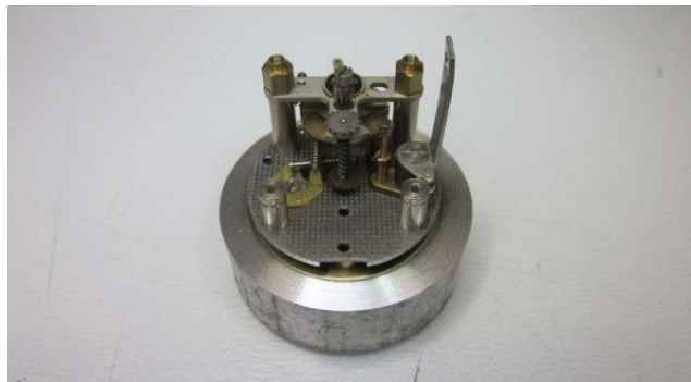
Photo 4 - The coil removed ready to remove the input terminal for modification.

the coil and then remove the coil assembly ( Photo 4 ) by snipping the wires, leaving them as long as possible.