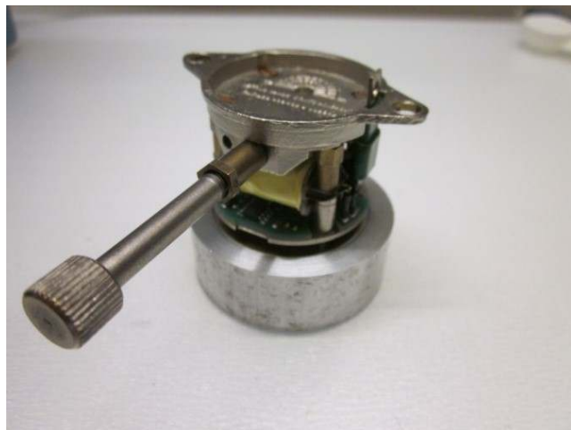
Photo 6 - The finished clock with kit fitted ready for refitting into the Rev Counter.

coil wires can be fixed to the circuit board by heatshrinking sleeves over the terminals. Finally, the clock back and setting stem can be re-fitted with its four screws. Re-assembly at the back of the clock is then complete and all that remains is to re-fit the dial and the hands ( Photo 6 ).