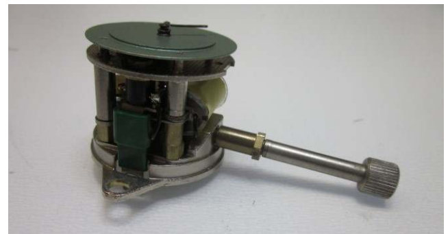
Above: Photo 2 - The clock as removed from the Rev Counter ready to be modified. Below: Photo 3 -The clock with back and setting stem removed.

The first step is to remove the clock from the car ( Photo 2 ) and then remove the four screws that attach the base and setting stem ( Photo 3 ).